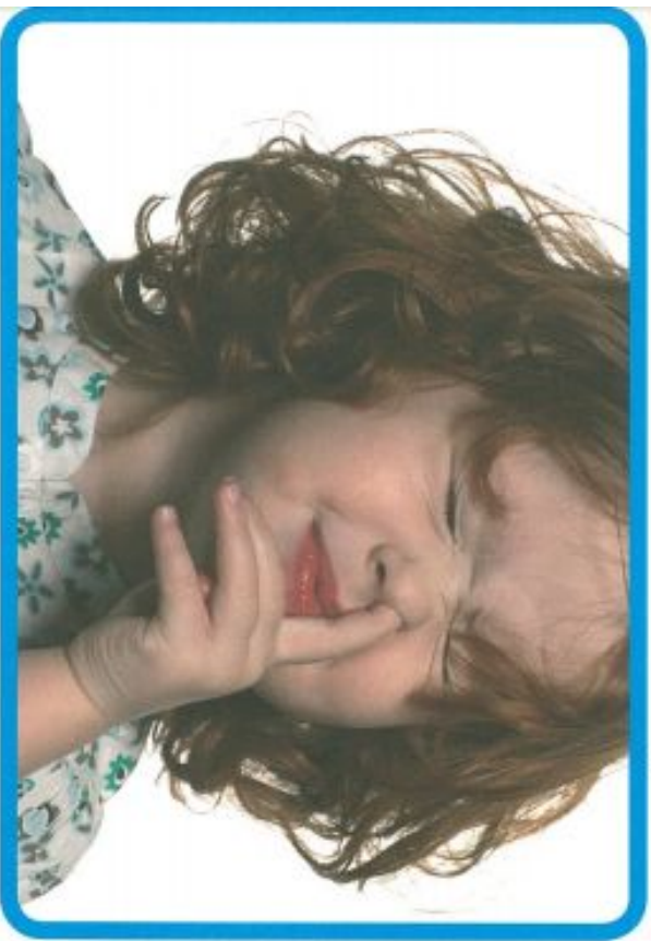
2010 © Copyright Triple P International Pty.Ltd. | Design: Triple P Communications